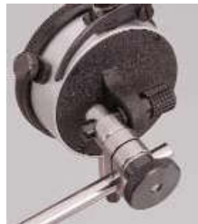
No. 657Y Indicator Attachment shown with lug-on-center back.